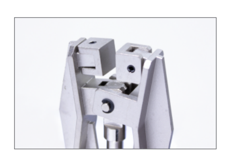
Grip face along with specimen surface