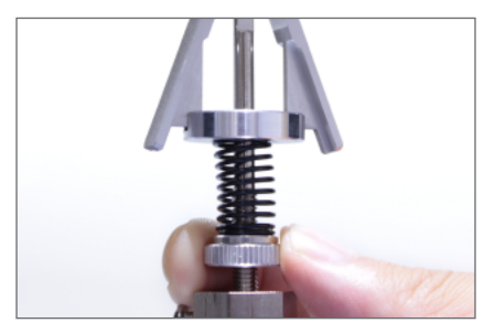
Adjustment screw of clamping force