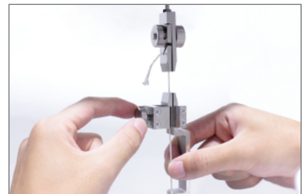
Lower gripping of yarn with tension