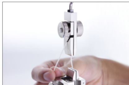
Gripping of yarn in the upper grip is helped by the notch