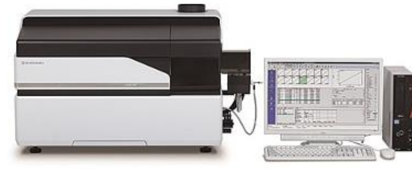
Figure 1: ICPMS-2030

Food safety may occur in food planting, processing and packaging. It has drawn great concerns due to air and soil pollution, environmental contamination and misuses of additives and materials in food processing and other human activities. Metal toxicity can be acute or chronic, depending upon one's dietary intake and duration of exposure. Toxic elements such as As, Cd, Pb and TI are well known as they are among the most hazardous materials present in food chain based on their prevalence and the severity of their toxicity. Even at low concentration, these heavy metals could be potential threats to human health. Cr, Ni, Se are either required for plant growth or considered as essential micronutrient elements. However, they would become toxic at high concentrations. The determination of trace level metals in food is critical for food safety and human health [1, 2]. Among various techniques for heavy metal analysis, ICP-MS is the most ideal and reliable technique for measuring toxic elements in food due to its superior low detection limit, high throughput, wide linearity range and less interferences.