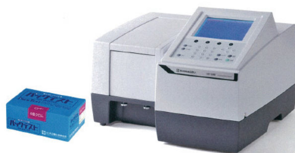
Fig. 1 UV-1280 and PACKTEST Product