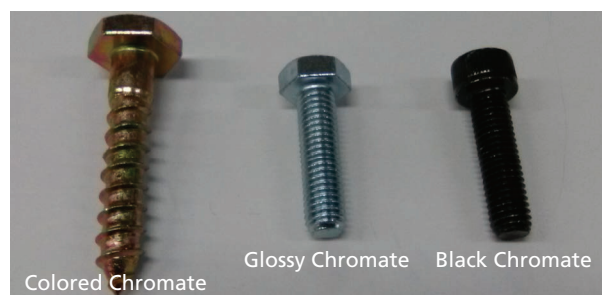
Fig. 3 Chromate-Coated Screws