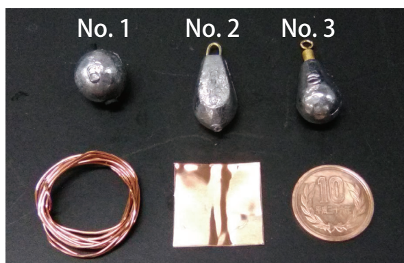
Fig. 4 Lead Samples and Copper Samples