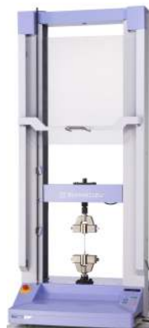
AGS-X Table-Top Precision Universal Tester