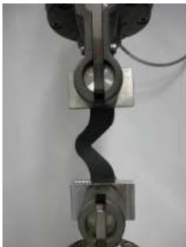
Fig. 1: Test Status