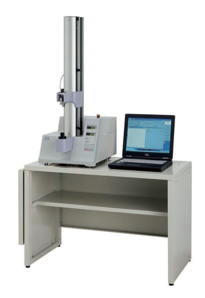
Fig. 1 Overview of EZTest Texture Analyzer