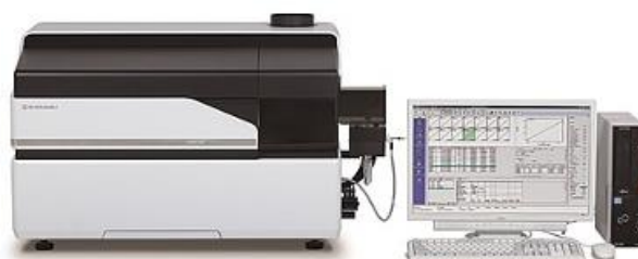
Figure 1: ICPMS-2030

All analyses was carried out on Shimadzu ICPMS-2030 coupled with mini torch and AS-10 autosampler. The detailed instrument configuration and operation parameters were summarized in Table 1. Helium collision cell provides an effective way to remove possible polyatomic spectral interferences. The cell gas mode was applied for all the elements except for Li and Sb as shown in Table 2. The instrument was tuned and optimized using a mixed tuning solution and warmed up to 30 minutes before measurement.