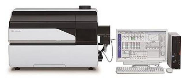
Figure 1. ICPMS-2030

Weighted sample (approximately 0.4g) was transferred into the vessel of microwave digestion system (Milestone Ethos Easy). Concentrated strong acids, hydrogen dioxide in ultrapure grade and DI water were added into each vessel shown in Table 2.