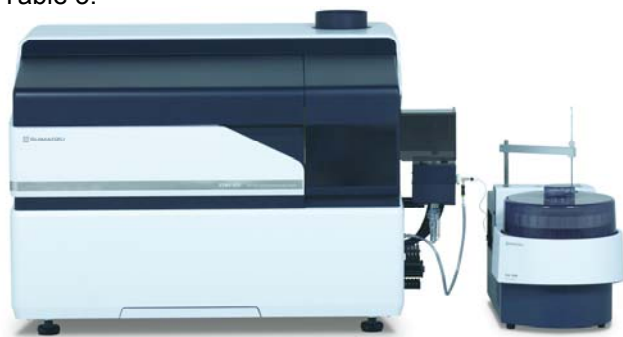
Figure 1. ICPMS-2030 Inductively coupled plasma mass spectrometer with AS-10.

A Shimadzu ICPMS-2030 coupled with auto sampler AS-10 (Figure 1) was used. The detailed instrument configurations and operating parameters are summarized in Table 5.