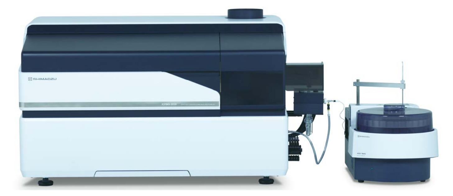
Figure 1. Shimadzu ICPMS-2030 with Autosampler AS-10