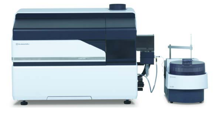
Figure 1.Shimadzu ICPMS-2030 with autosampler AS-10

A Shimadzu ICPMS-2030 coupled with auto sampler AS-10 (Figure 1) was used for analysis.