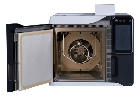
Fig. 1 Example of Installation of Glass Column

The FID-2030 can also be switched to packed column use or capillary column use by a simple modification using the FID-2030Packed kit (P/N: S221-85191-41).