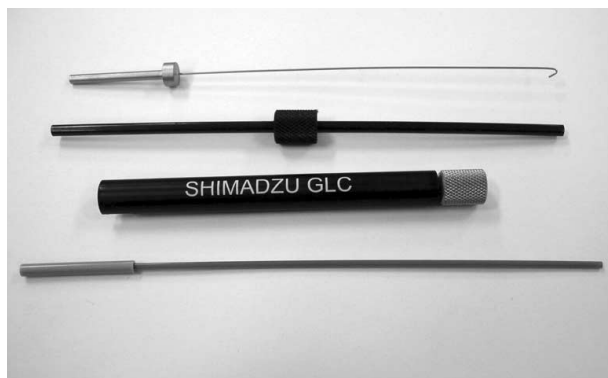
Fig.2 Insert-Wool Packing Tool

In order to ensure that the silica wool is packed uniformly and that the top surface is flat, it is recommended that Shimadzu's simple insert-wool packing tool (P/N : 092900, Shimadzu GLC) is used to pack the silica wool