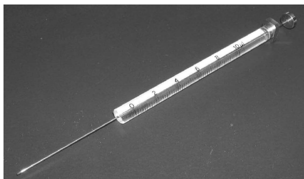
Fig.3 AOC Elastic Syringe (P/N : 221-49548)

If an aqueous solution is analyzed with a standard auto-injector syringe, plunger movement may become heavy during operation and this may adversely affect the repeatability. Sticking of the plunger in aqueous solution analysis can be reduced by using the AOC elastic syringe (P/N : 221-49548), which has a titanium plunger. This syringe incorporates a septum to prevent clogging in the needle tip (modified needle-tip shape) and is therefore effective for the analysis of other types of sample analysis.