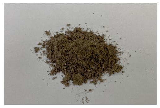
Fig. 2 Soil B Used in Measurement (Commercial Product)

In this experiment, two types of soil samples (soils A and B) and one type of compost sample were prepared. Fig. 2 shows the appearance of soil B. Approximately 100 mg of each sample was weighed in a sample boat (Fig. 3), and TC (total carbon) was measured. Table 1 shows the measurement conditions.