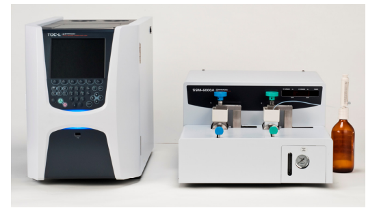
Fig. 1 TOC Solid Sample Measurement System

The TOC solid sample measurement system (Fig. 1), consisting of a Shimadzu TOC-L total organic carbon analyzer and SSM-5000A solid sample combustion unit, quantifies the carbon content of a solid sample by combustion oxidation of the sample and detection of the formed carbon dioxide. Simple and quick analysis of the total carbon content is possible because extraction and other complicated, time-consuming pretreatment processes are not necessary.