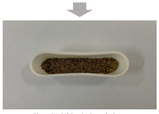
Fig. 3 Weighing in Sample Boat