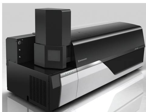
Fig. 1 DPiMS™-8060

Product ion scanning was used for the qualitative analysis of anthocyanin pigment in petunia flower petals. Table 1 lists the analytical conditions and Fig. 2 shows the result of a product ion scan.