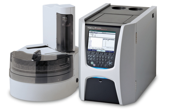
Fig. 2 Shimadzu Total Organic Carbon Analyzer; TOC-L