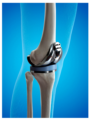
Fig. 1 Artificial Knee Joint

Orthopedic implants are medical devices used to support damaged bones or even to replace missing joints. The number of surgeries for the insertion of implants is increasing because of advancements in implant products and improvement of surgery techniques. Implants must be biocompatible and especially clean to mitigate the risk of implant rejection and other health issues for the patient. Due to this, effective methods for cleaning and for the evaluation of cleanliness in the production of implants are of great importance.