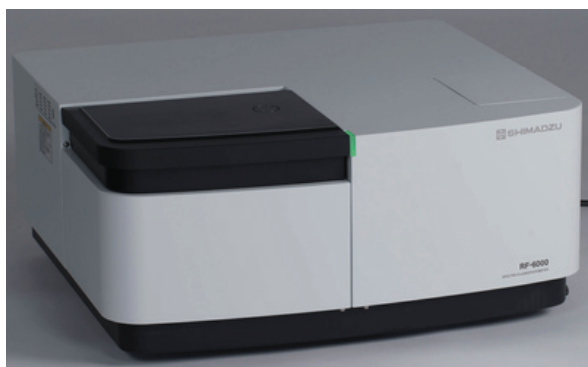
Fig. 1 RF-6000 Spectrofluorophotometer

Introduced here are the measurements of porphyrin solution (solvent: chloroform), an organic EL material, using an RF-6000 spectrofluorophotometer, with the help of the Institute for Basic Science, Pohang University of Science and Technology (POSTECH), South Korea.